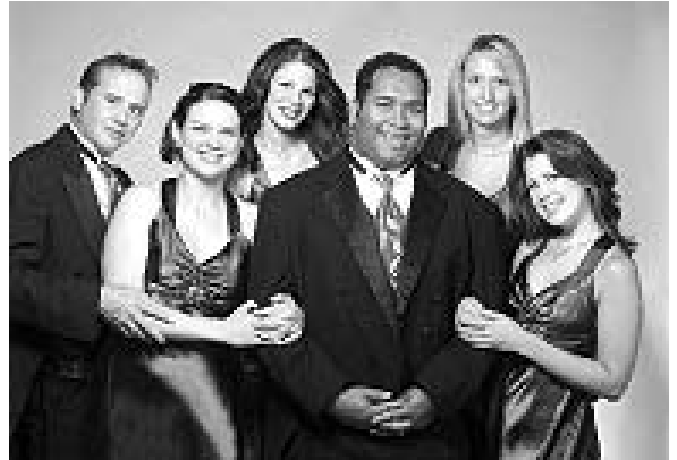
The charming and talented performers of Latshaw Productions' "Big Band Christmas Spectacular" will be at Lombardo's in Randolph this November. Their professional harmonies and solo numbers are accompanied by a full 20-piece orchestra. The performance and luncheon are to be held in one of Lombardo's elegant ballrooms.

The lunch includes: New England roasted turkey, garlic mashed potatoes, glazed petite carrots, lemon angel cake, coffee and soft drinks.