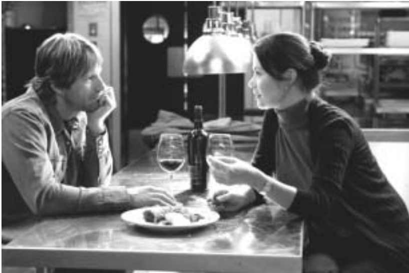
Academy Award-winner Catherine Zeta Jones and the charming Aaron Eckhart team up for the romantic comedy about love and the restaurant business in No Reservations .