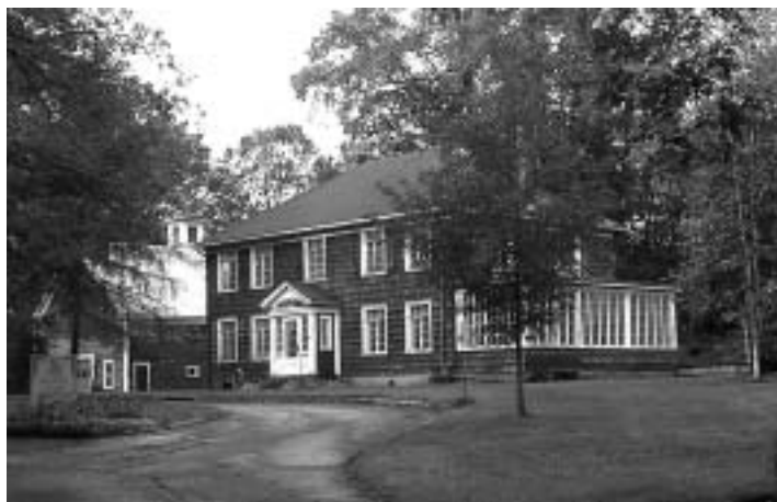
The Friends of Seniors is sponsoring a fund-raising walk on September 13 at Sachem Rock Farm. Pictured is the house and barn located on the historic 32-acre, town-owned property.